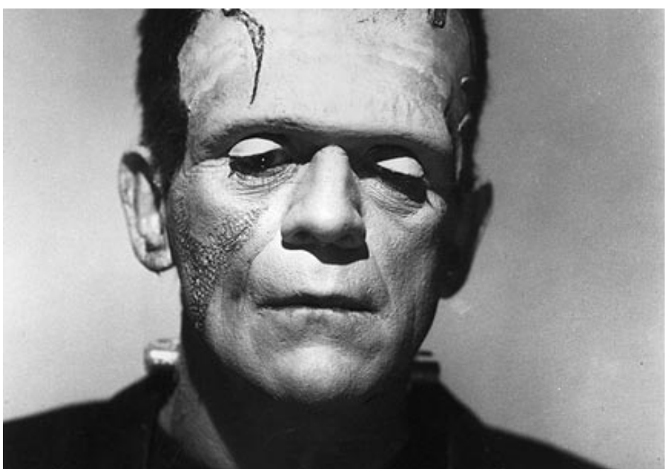
BBC Scotlandshire Directors have today announced their bid to decide the wording of the question to be set by the separatist SNP Scottish Executive, if they achieve their aim of holding a referendum on separation in 2014.

Earlier this year, the UK government through the Scottish Office, undertook a UK wide consultation on the proposed referendum in a completely successful move to take control of the referendum process and thereby legally pokcle it.