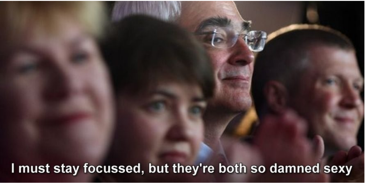
Sergeant Nuttem N. Bookem of Strathclyde constabulary's Abominable Repeat Scaremongers Eradication Squad told BBC Scotlandshire:

"Police constantly warn the media that if they are offered dodgy products, then they need to be suspicious and check the provenance of the goods. It should be second nature."